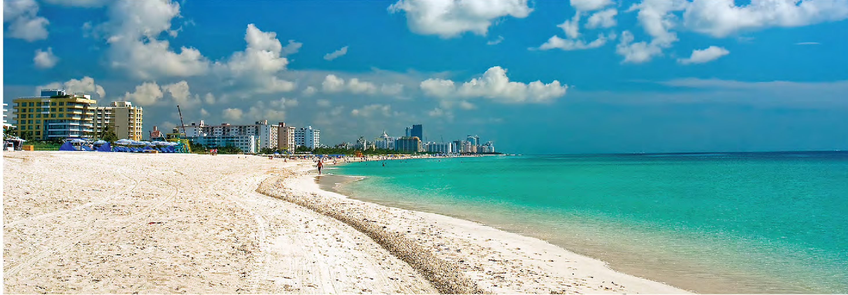
An instant icon of 21 st century architecture, Kai at Bay Harbor pierces North Miami's coast with elegance.