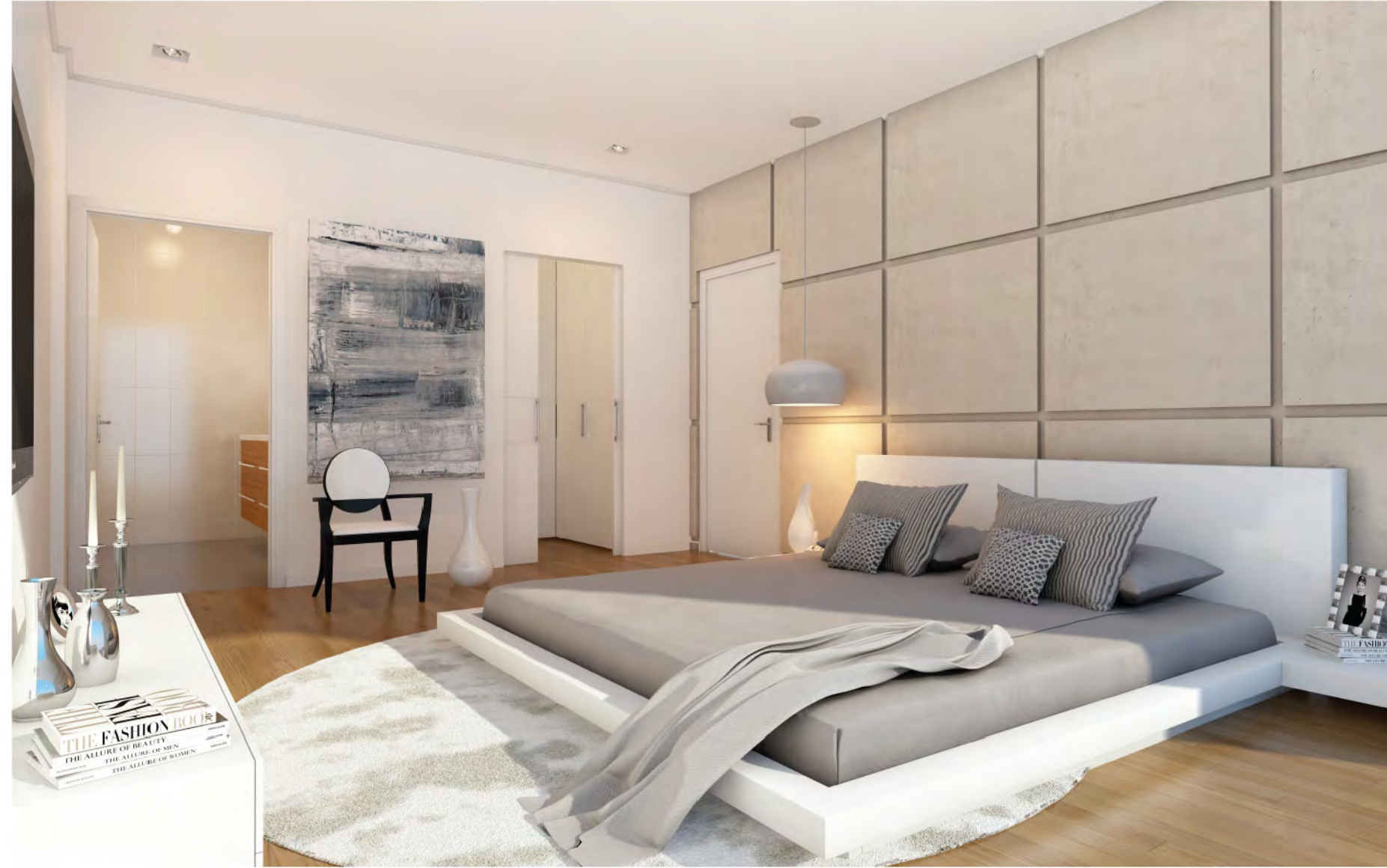
Wide, sun-filled bedrooms provide idyllic views.