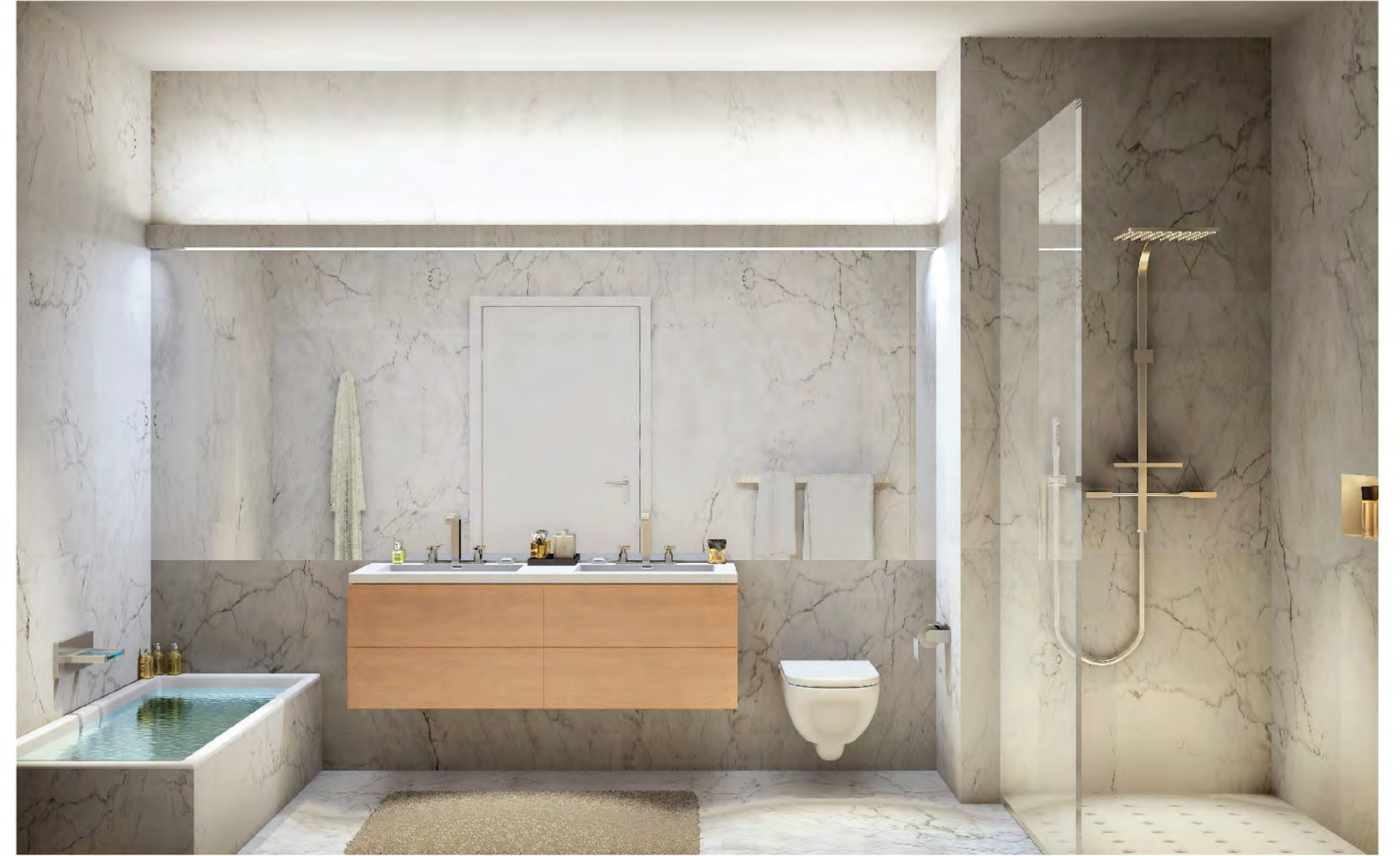
Sleek designs set a tranquil tone with marble floors and luxurious Jacuzzis.